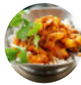
KING PRAWN KORMA 194 kr