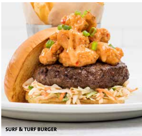
SURF & TURF BURGER

Two smashed & stacked burgers seasoned and seared to medium-well, with Monterey Jack cheese, pickled jalapeños, leaf lettuce, vine-ripened tomato and spicy mayonnaise.* Δ 195 DKK