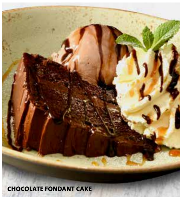
CHOCOLATE FONDANT CAKE