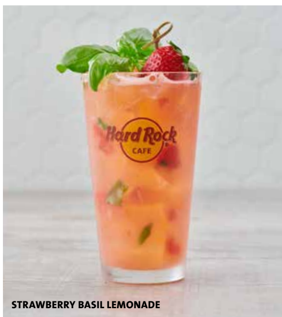
STRAWBERRY BASIL LEMONADE

A tropical blend of mangos, strawberries, pineapple juice, orange juice and house-made sour mix topped with lemon-lime soda. 73 DKK