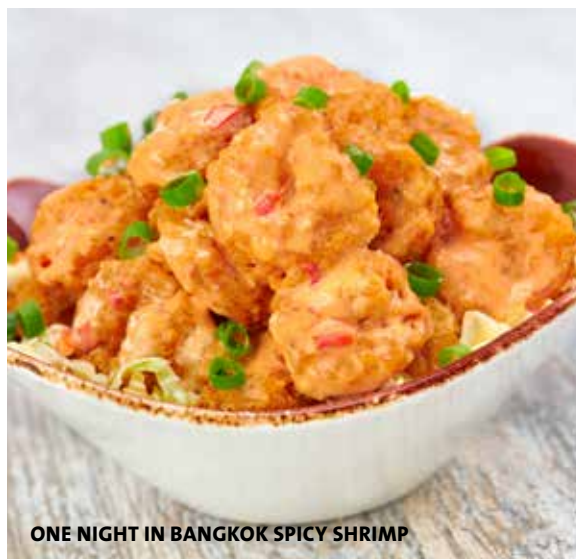
ONE NIGHT IN BANGKOK SPICY SHRIMP

Crispy tortilla chips layered with black beans and queso, topped with fresh pico de gallo, spicy jalapeños, melted Cheddar and Monterey Jack cheese, pickled red onions, green onions and topped with lime crema. # 162 DKK Add Guacamole# (GF, VG) 35 DKK or Grilled Chicken 60 DKK or Grilled Steak* 70 DKK